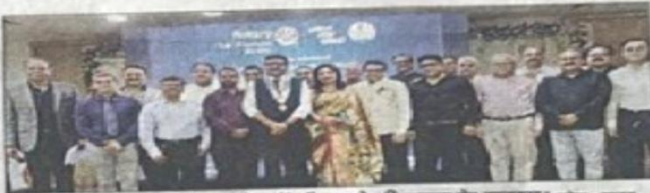
मानचंद वाटिका में समारोह में मौजूद रोटरी क्लब के सदस्य।

सोनीपत। रोटरी क्लब ऑफ सोनीपत की ओर से मानचंद वाटिका में क्लब का स्थापना दिवस समारोह मनाया गया।