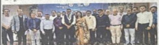
रोटरी क्लब के कार्यक्रम में मुख्य अतिथि व पदाधिकारी।